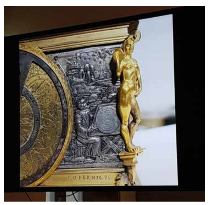
Links: Bürgis Uhren in Kassel; rechts: Detail der Mondanomalienuhr (Vortrag Michael Beck)

Die Vorträge finden sie in online unter <u>https://www.jostbuergi.com/symposium/</u> und <u>https://www.jostbuergi.com/experten-workshop/</u>.